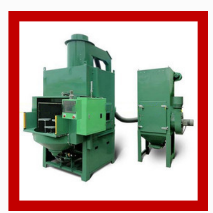
Indexing Table Type Deflashing Machine