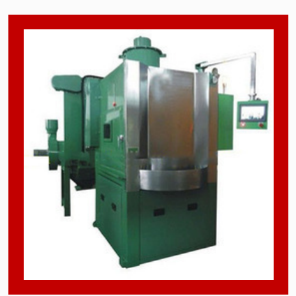
Rotary Table Type Deflashing Machine