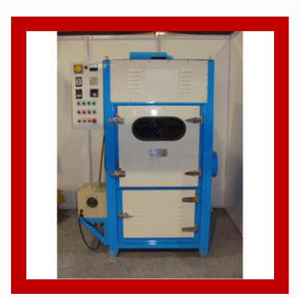
Tumble Type Batch Deflashing Machine