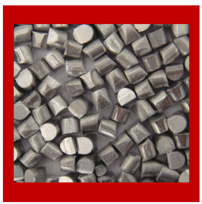
Aluminum Cut Wire Shots