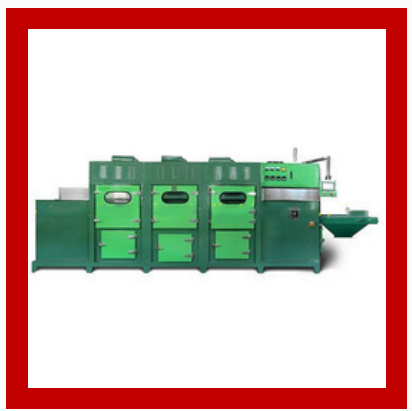
Automatic Tunnel Type Continuous Deflashing Machine