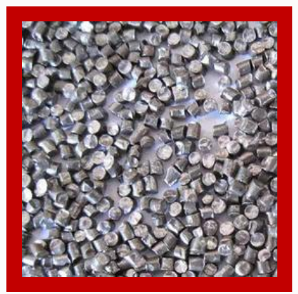
Stainless Steel Cut Wire Shots