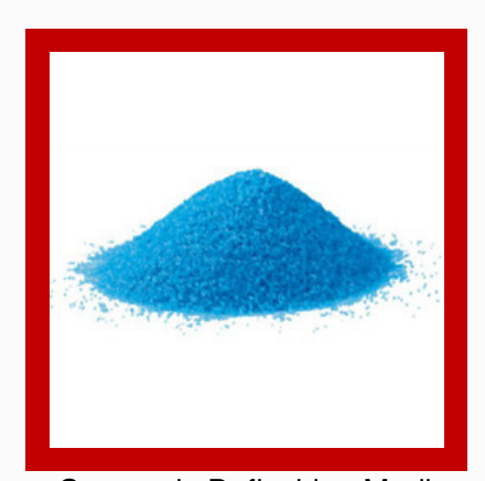
Cryogenic Deflashing Media