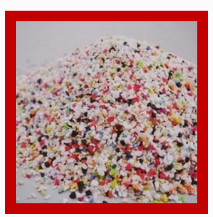
Melamine and Acrylic Media