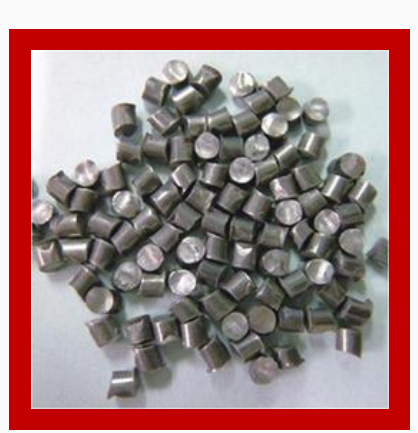
Zinc Cut Wire Shots