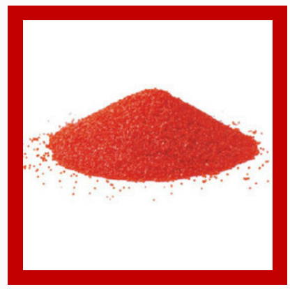
Nylon Deflashing Media