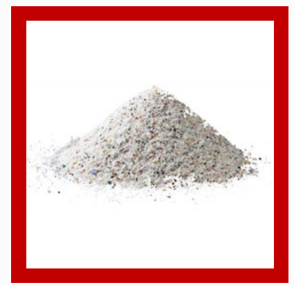
Melamine Type III