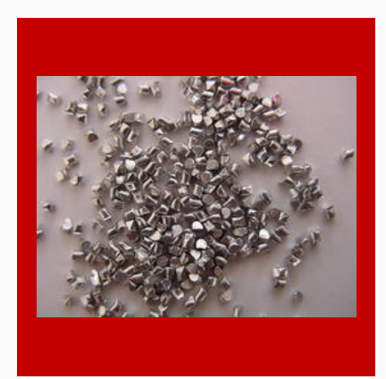
Carbon Steel Cut Wire Shots