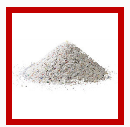
Acrylic Type V